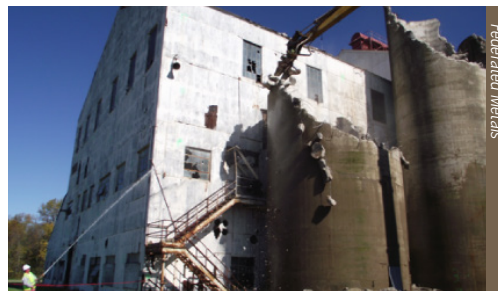
Building Decontamination and Demolition