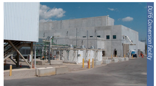
Design-Build Construction Services