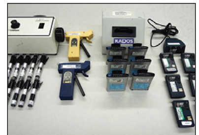
Dosimeters (SRDs, EPDs)