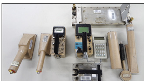
Data loggers & assorted detectors