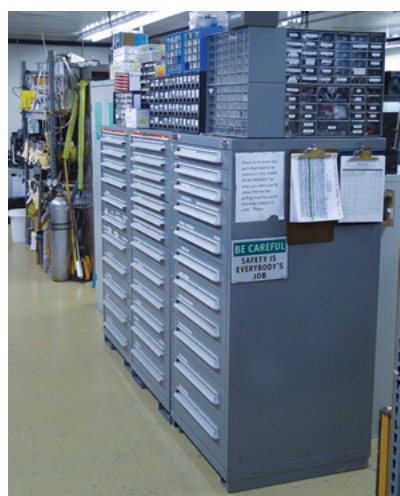
Left: Repair and calibration staff Middle: Multiple Cs-137 calibrators for low and high-range meter dose rate calibrations ( open beam calibrator shown ) Right: Large repair parts supply Below: Air sampler bench