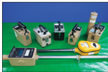
Gamma survey meters