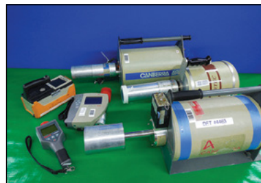
Gamma spectroscopy systems