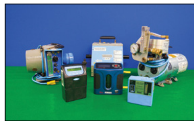
Air sampling equipment